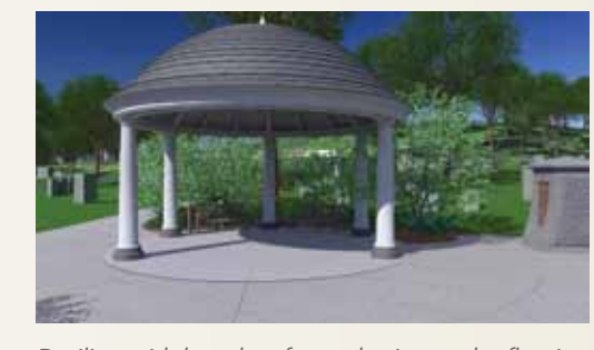
Pavilion with benches for gathering and reflection