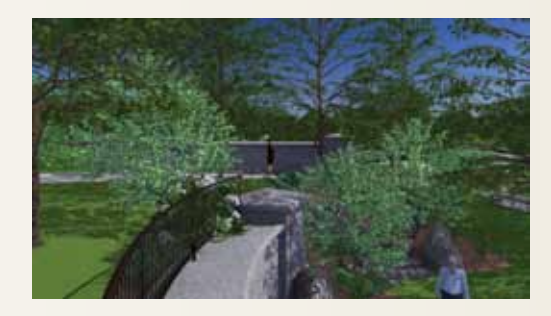
Majestic views of the cemetery